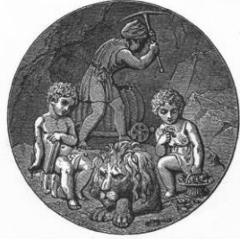
Natural History Society of Northumberland, Durham, & Newcastle upon Tyne.

The Natural History Society Logo by Bewick, 1829.